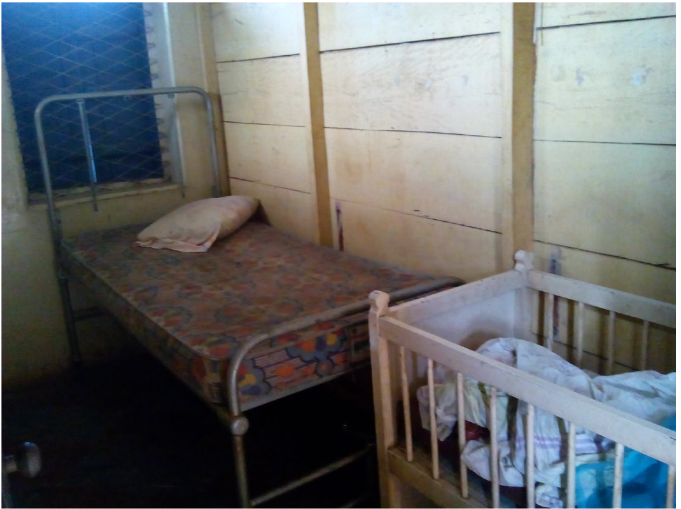
A mother and newborn curdle here after delivery, at Ikoto, Ijebu

conomic implication of maternal mortality. This is apart from the emotional trauma and psychological damage of losing a loved woman or child.