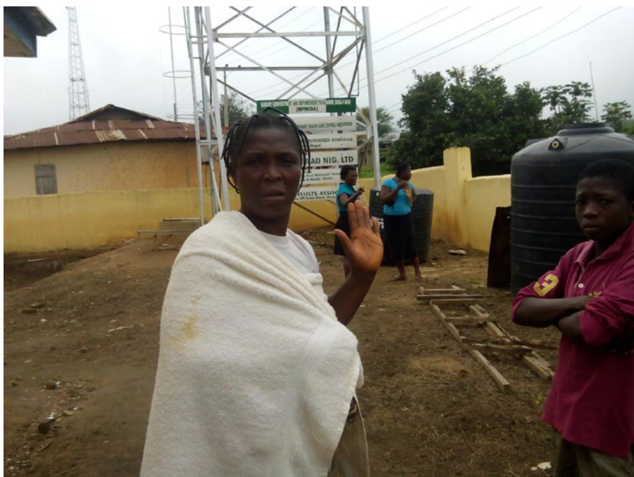
An unhappy patient, dissatisfied at services rendered at a SURE-P assisted PHC, Ikogosi, Ekiti State