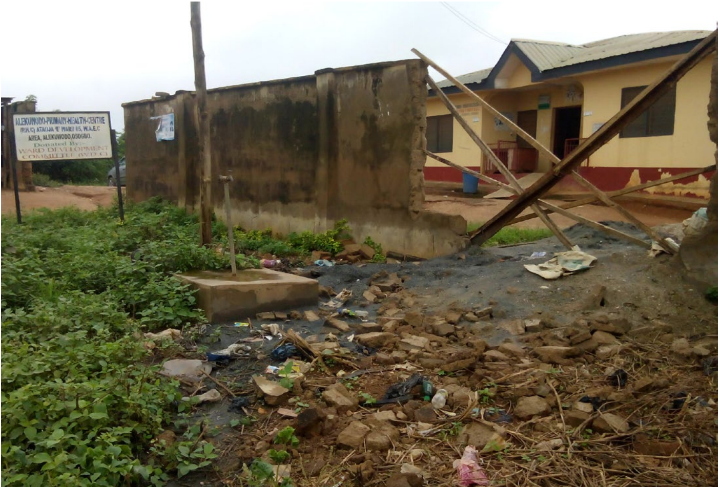
Frontyard of a health center, at Osogbo, Osun State

N55,000 ($333) is allocated for fuelling the director's vehicle; N45,000($272) is for carrying out routine activities such as family health, national program on Immunization, maternal and child health, health education , while N25,000 ($151) is allocated to three deputy directors."