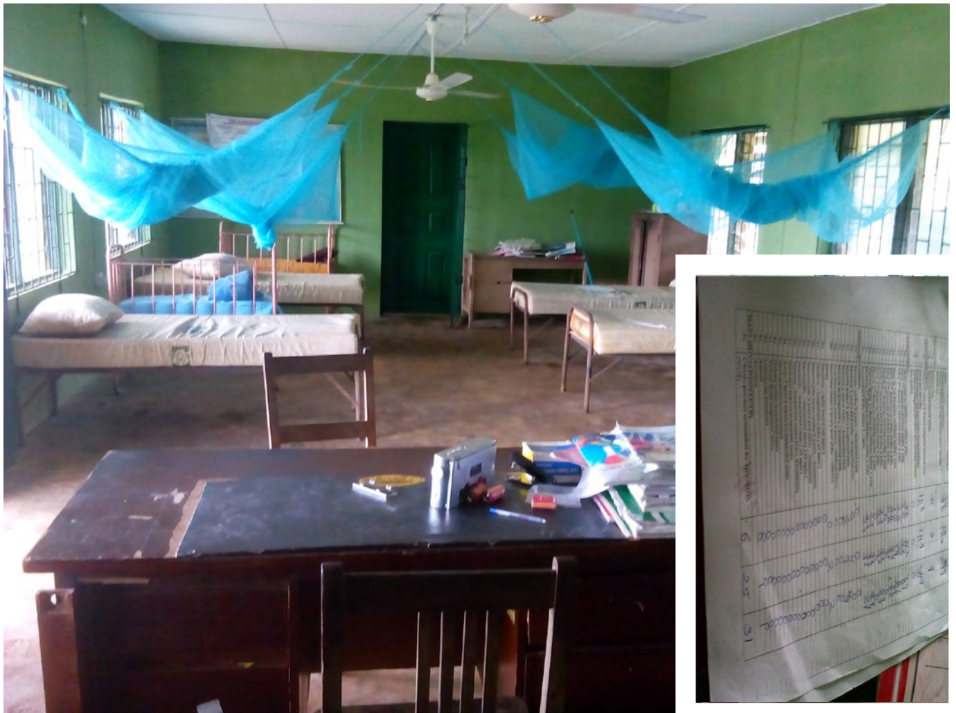
Ghost workers....no staff, no patients

“We only have four beds, it is too small for the flow chart of patients we receive here; no baby courts, mothers have to sleep by their baby side on the same bed. We do not have water, we used to beg for water from one man opposite us there, who has a bore hole. Our forceps and scissors are spoilt, no circumcision kits, no replacement. We do not have consultation room, so a patient cannot have confidentiality.”