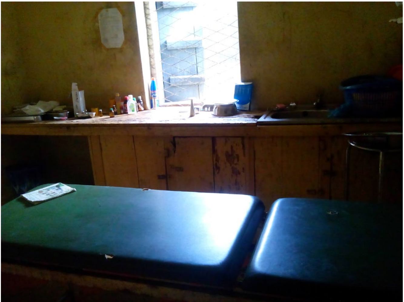
An inappropriate delivery couch, in the labour room, at the Holy Trinity Health Center, Ikoto, Ijebu, Ogun State