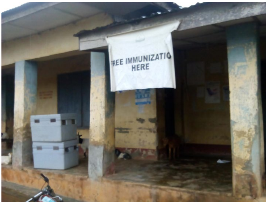
Instead of humans, a family of cats and goats seen at the terrace of a PHC, in Oyo State

we treat here. The community health committee also gave us money, which we used to pay our NEPA (electricity) prepaid meter bills. I also make money from circumcision,” she offered.