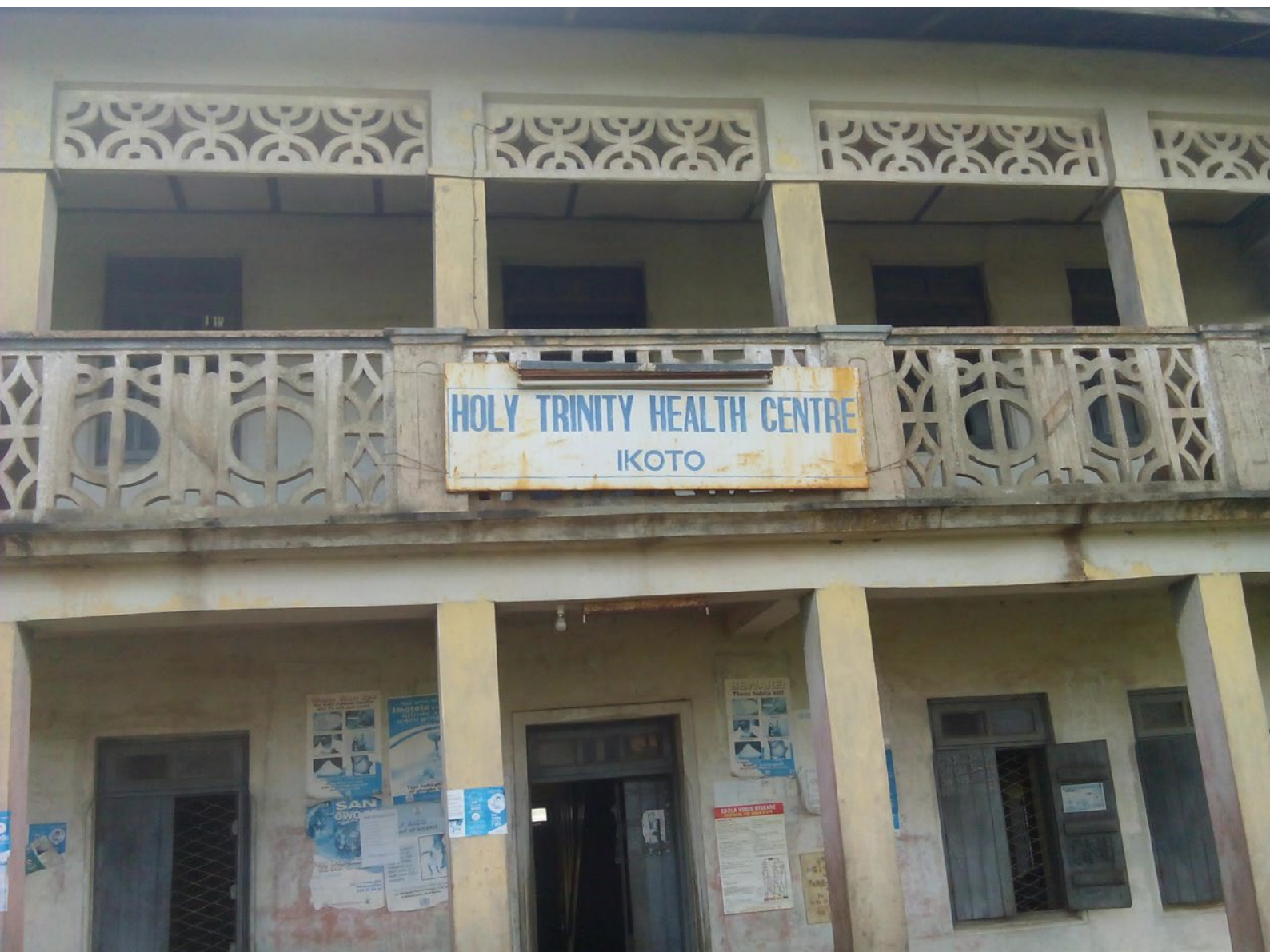
Building as old as the colonial era

which had been left unwashed. It would be noted that infection (septicaemia) is the second leading cause, of all maternal and new born deaths, accounting for about 17 per cent.