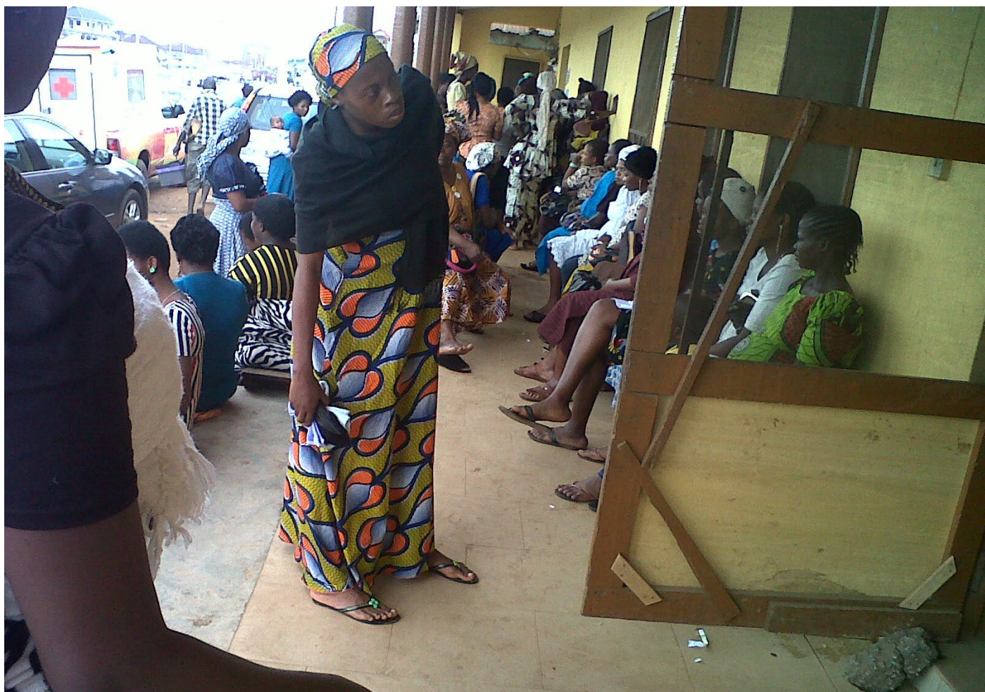
No chairs inside, a pregnant woman peeps to see if its yet her turn

We need a lot of equipments. For example, we have only one weighing scale, so on immunization days the women have to make a long queue to get their children weighed. This syphg (Blood Pressure apparatus) is not working well. Even light; we have not had light for a long time.